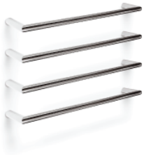
Single bar - Round TW001