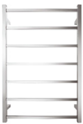
Square tubes TW107