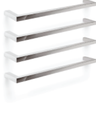
Single bar - Square TW002