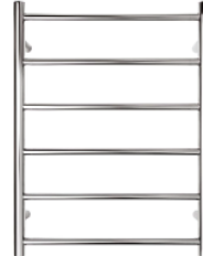
Round tubes - Straight TW091