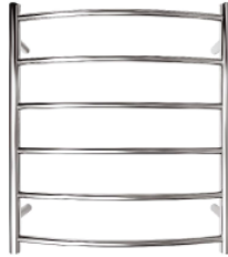
Round tubes - Curved TW090