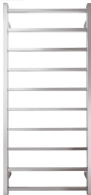
Square tubes TW110