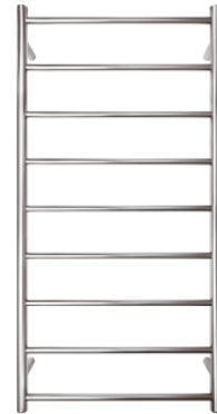
Round tubes - Straight TW092