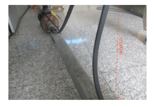
2-Insert the Pressure Seal End first and then the grommet for each cable.

1- Leave extra wire for connections and mishaps.